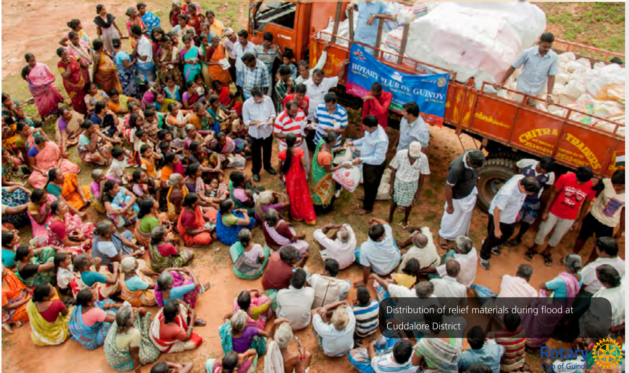
Distribution of relief materials during flood at Cuddalore District